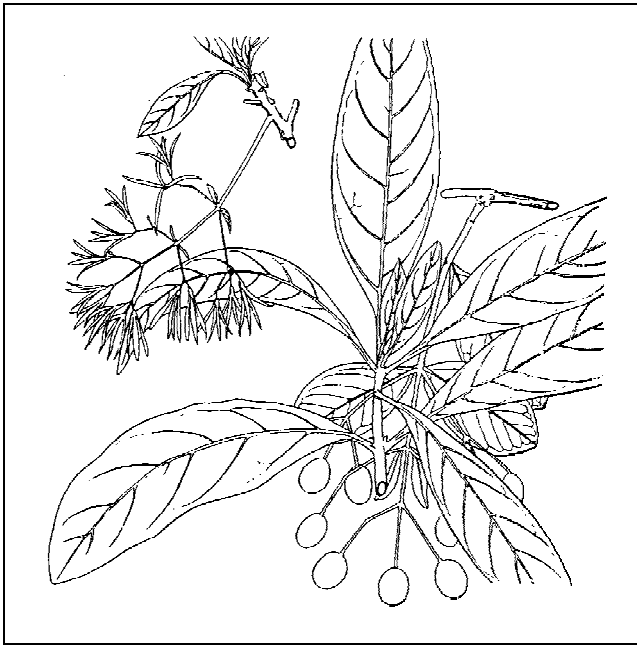
Figure 3. Foliage of Fringetree.